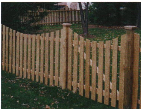
Pressure-treated, scalloped 2" spaced picket with cedar post caps