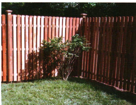
Red Cedar, Dog-eared Boca (tight) shadow box, 4" boards, 39 per 8' section, cedar post caps