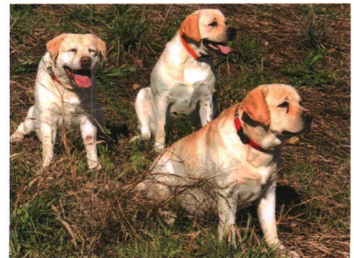
Fence City mascots