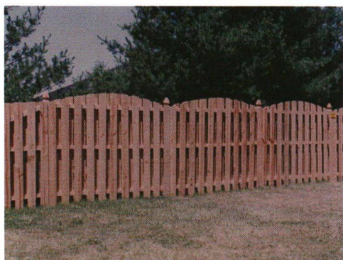
Domed, Pressure-treated, shadow box with 6" boards, French Gothic top posts