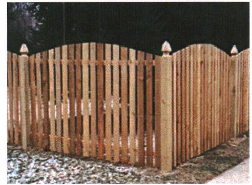
Red Cedar, domed spaced picket, 1-1/2" space, 4" boards, French Gothic posts