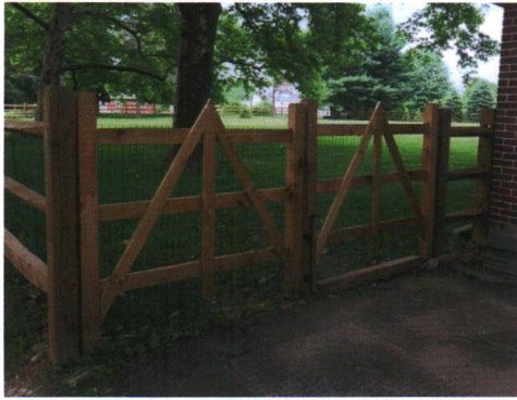
Pressure-treated Split rail, 4-ft tall, 3-rail, double gate, green vinyl wire