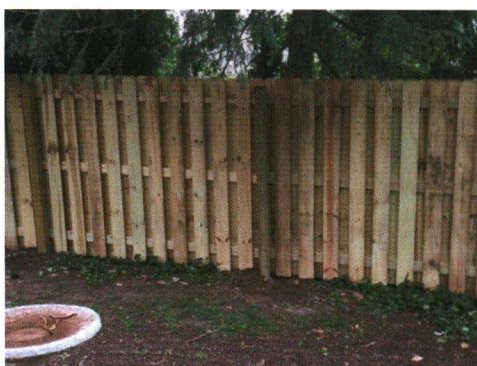
Pressure-treated, Dog-eared, shadow box, 6" lumber, flat top posts