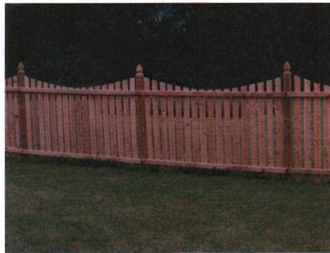
Red Cedar, scalloped spaced picket, 2" space, 4" boards, French Gothic posts