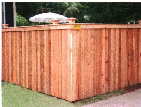
Red Cedar, Cap-and-Face with cedar post Caps, 4" boards