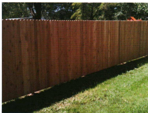
Red Cedar, Dog-eared solid board with 4" boards (outside view)