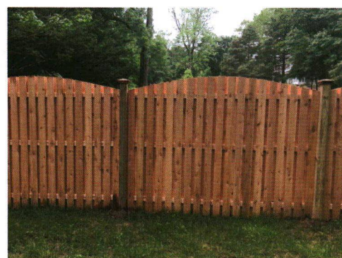
Red cedar, domed shadowbox (tight), 4" boards, 39 per 8' section, cedar post caps (inside view)