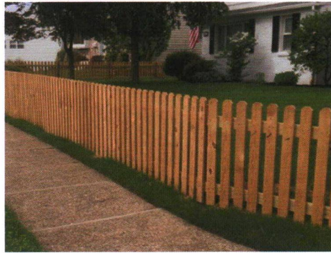
Pressure treated, 2" spaced picket with dog-eared top and flat top posts