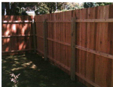
Red Cedar, Dog-eared solid board with 4" boards (inside view)