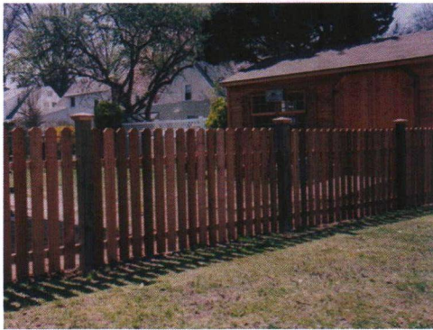
Red Cedar, spaced picket, 1-1/2" spaced dog-eared with cedar post caps