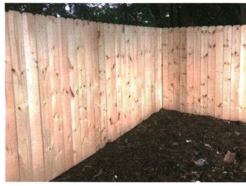
Pressure-treated, Dog-eared solid board, 6" boards, 2" x 4" backing rails