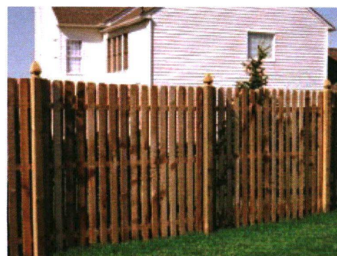
Red Cedar, Dog-eared Boca (regular) shadow box, 4" boards, 33 per 8' section, French Gothic post caps