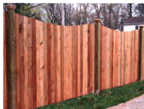
Red Cedar, Scalloped solid board, 4" boards, cedar post caps