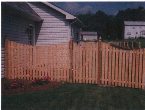
Red Cedar, scalloped spaced picket, 1-1/2" space, 4" boards, French Gothic posts