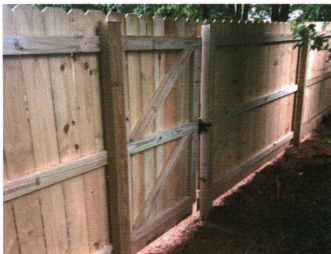
Pressure-treated, dog-eared solid board, 6" boards, (inside view) 2" x 4" backing rails