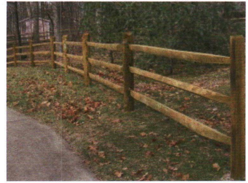
Pressure-treated Split rail, 4-ft tall, 3-rail