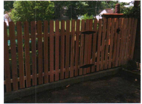
Red cedar, 1-1/2" spaced picket, flat top posts, 4-ft gate