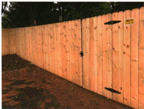
Pressure-treated, dog-eared solid board, 6" boards, 2" x 4" backing rails