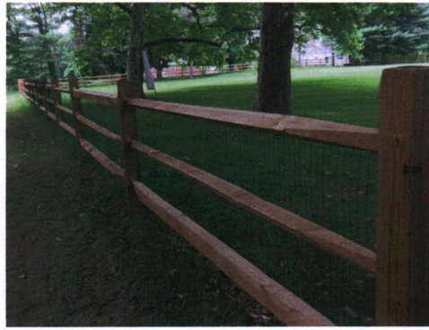
Pressure-treated Split rail installed with green or black wire, 4-ft tall, 3-rail